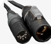
XLR 5 PIN IN Power OUT

A hybrid cable that combines power in+out and data in+out into 1 cable. Use it for a clean connection of 2 AX2-100 without sagging cables. Thanks to the special XLR connectors the JumpCable allows for a IP65 water resistant wiring connection.