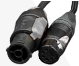
Power IN XLR 5 PIN OUT